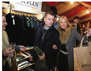
Excited shoppers exploring the Fair