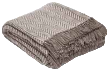
ABOVE: Weaver Green BELOW: Little Woodlands